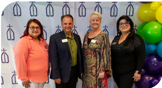
Our Brazos Valley Office staff enjoying the night.