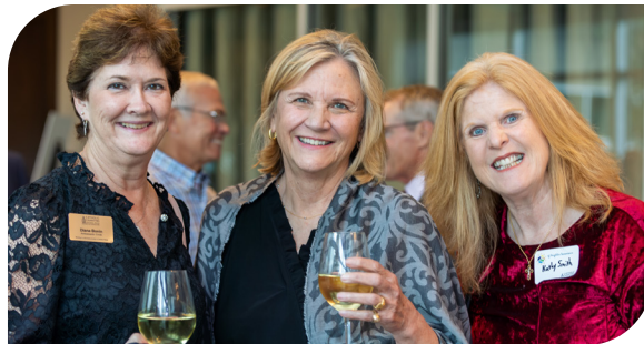
A group of our Brazos Valley supporters enjoying our new venue at The Stella Hotel!