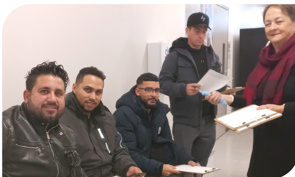
Students filling out paperwork for enrollment into the program.