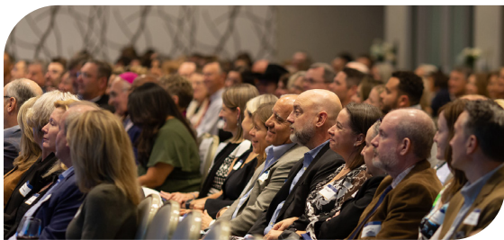
Creating Hope attendees listen to our evening program.