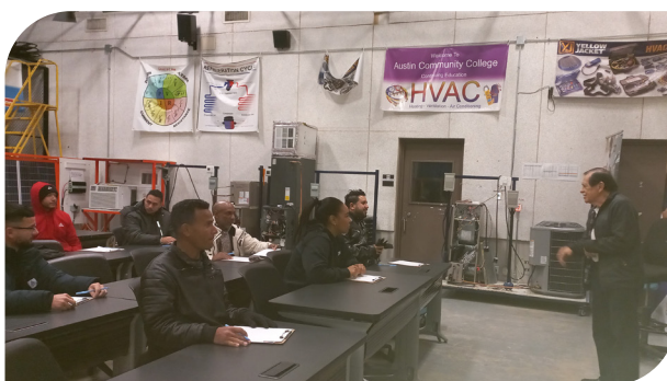
Students in our first class of our ACC partnership program with their instructor.

Starting over in a new country is not easy, but vocational training provides a path to success for refugees. CCCTX partnered with Austin Community College (ACC) to offer our refugee clients the education needed to secure stable jobs in their new home. Many refugees have education and professional experience in their home country which, unfortunately, cannot be applied in the U.S. Our partnership with ACC allows our clients to work toward earning HVAC technician certifications, opening doors to a new career path so they can provide for their families. These students are committed, attending multiple classes each week to stay on track. Join us in congratulating our first class of refugee clients, who are graduating in March! While much of the cost of this program is covered through our partnership with ACC, we are grateful to the Ladies of Charity-Lake Travis for their generous financial support that covers the gap to make this educational opportunity possible.