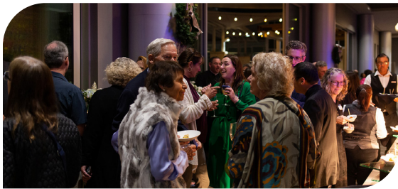
Attendees mingled during our social hour hosted on the patio of the beautiful Archer Hotel.